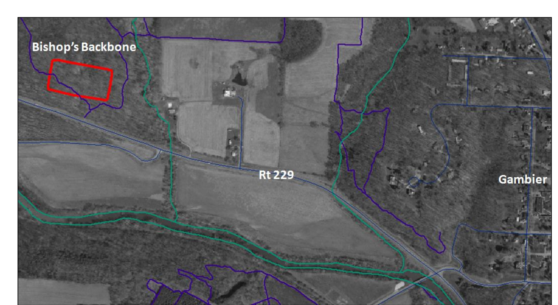
Figure 1. Map of Bishop's Backbone forest plot.

Survey: Remeasured 1699 trees to determine growth and recorded species, location and diameter at breast height (DBH) of 40 new individuals with DBH>1cm