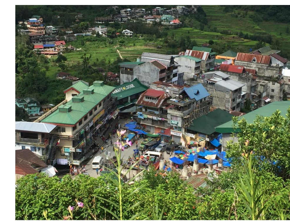
Fig. 5: Banaue – seat of Batad's municipal government.