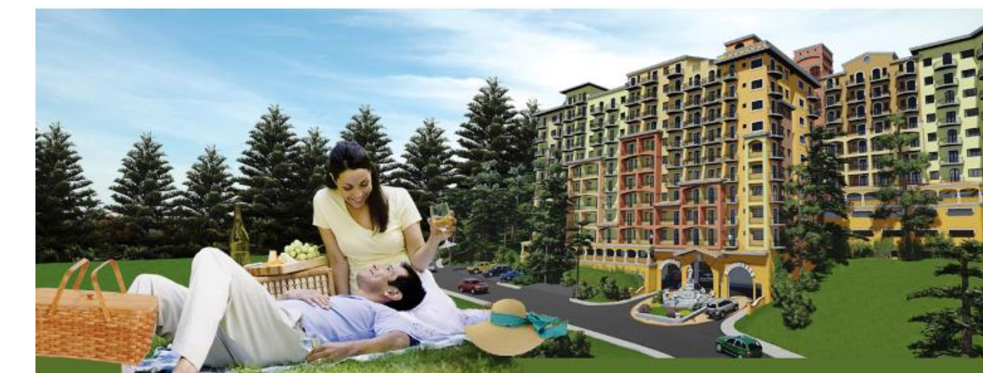
Fig. 6: Advertisement for SunTrust property depicting a building surrounded by pines.