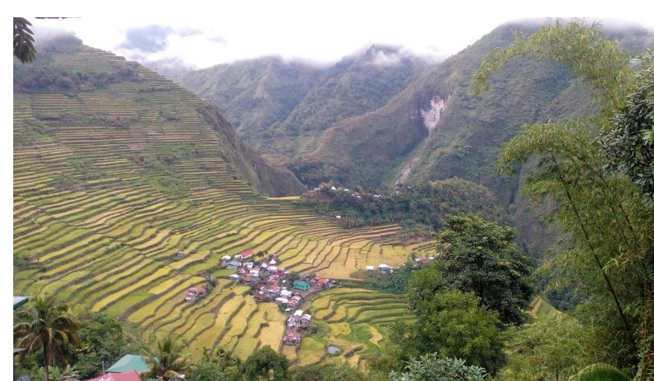
Fig. 2: View of Batad and its rice terraces.