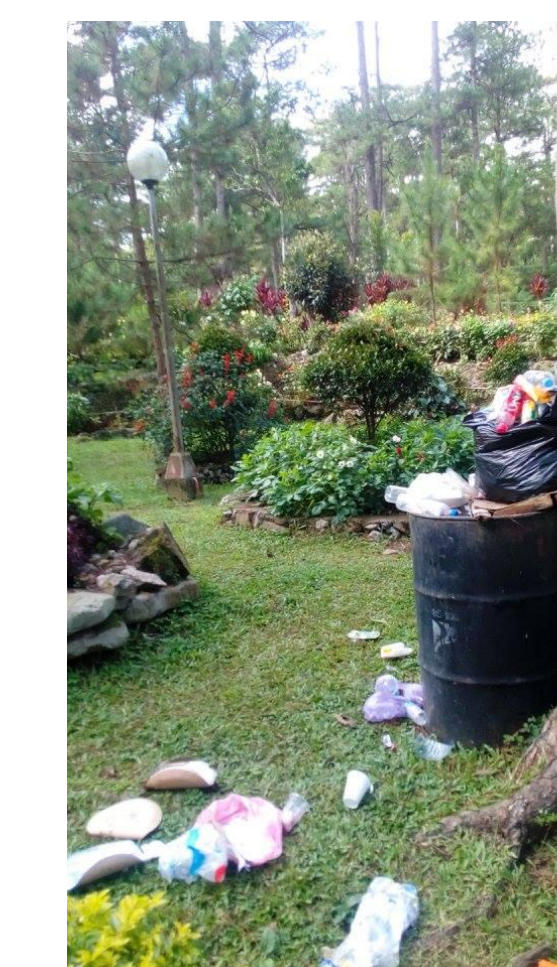
Fig. 7: Litter at Baguio's Botanical Gardens. “[The litter] is almost as plentiful as the flowers.” – Jenna Rochelle, '18