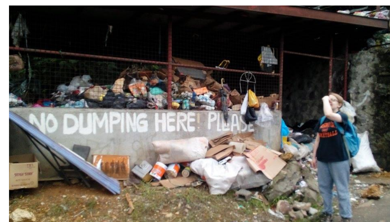
Fig. 4: Garbage in a “No Dumping” Zone.