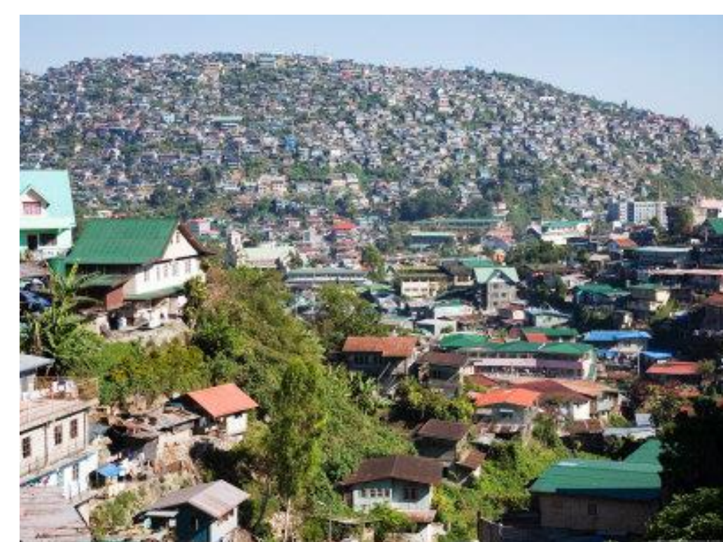
Fig. 3: View of Baguio City and its houses.